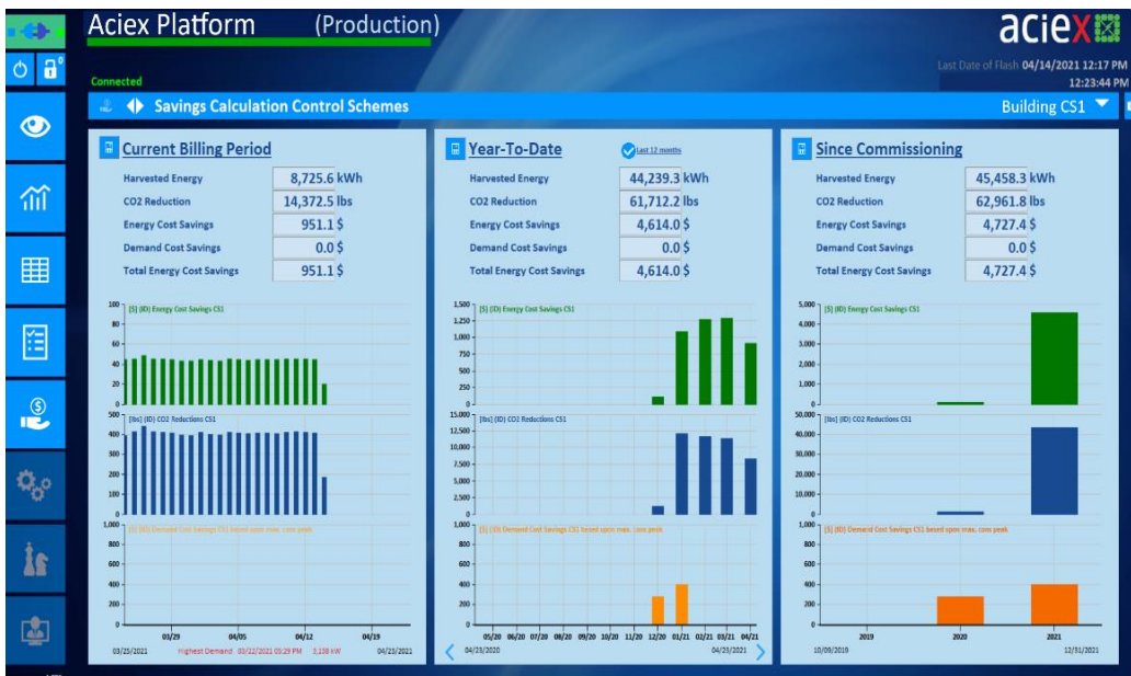
Acieux Platform - Calculated Savings Interface